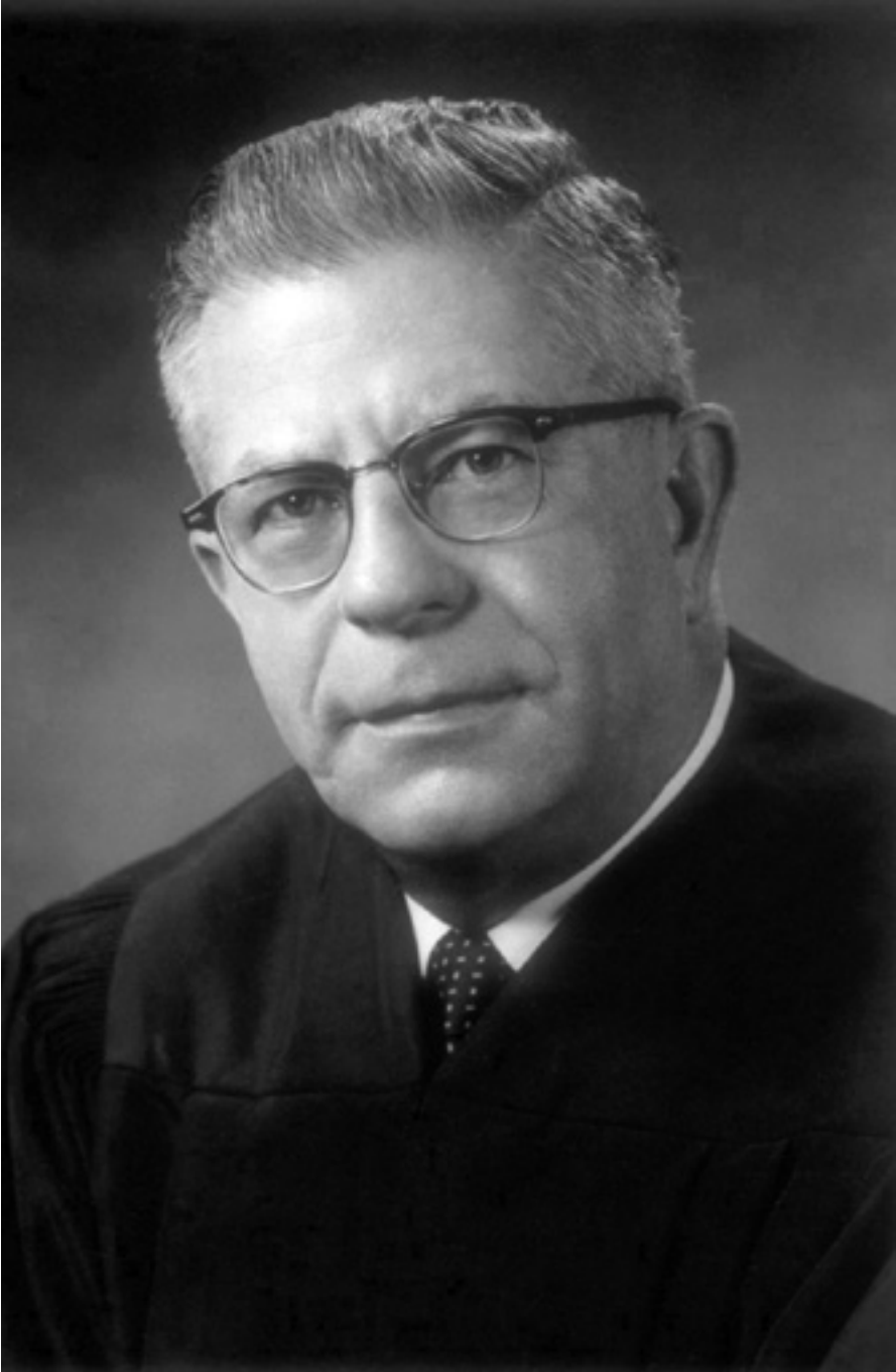
JUSTICE ROGER J. TRAYNOR