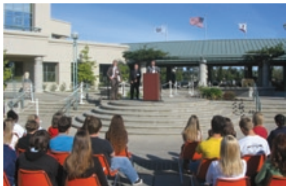
Students assemble on the plaza for an orientation briefing before entering the courthouse.