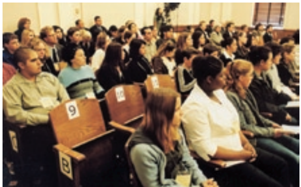
Students observe the proceedings and wait in numbered order to ask their questions.