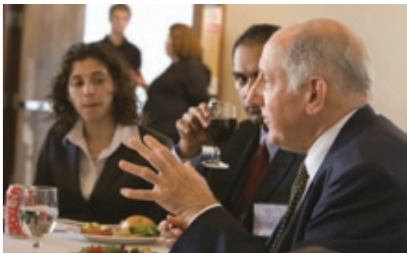
Chief Justice Ronald M. George (RIGHT).