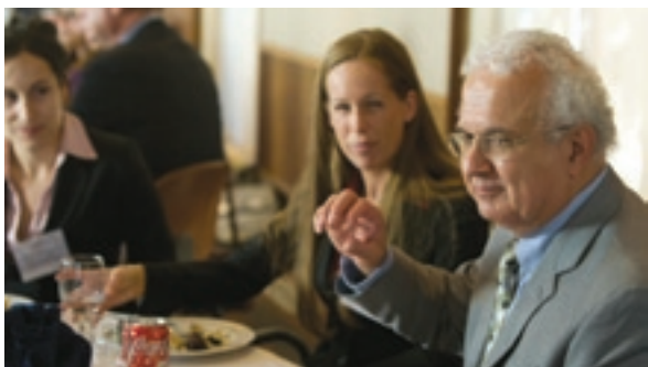
Associate Justice Carlos R. Moreno (RIGHT).