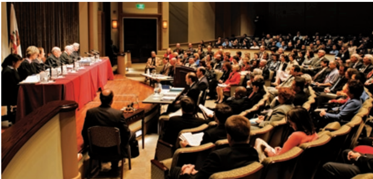
Students fill the auditorium of the Joan B. Kroc Institute for Peace and Justice (behind the bar at the rear).