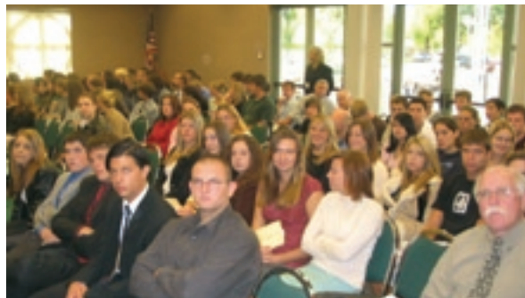
Each group of students observes the Court’s proceedings on closed-circuit television prior to entering the courtroom.

Judicial outreach wasn’t a new concept for Shasta County. The Sacramento-based Third District Court of Appeal heard oral arguments there in 2000. Since then, the Third District justices have convened in 17 more counties. They’ve sat behind makeshift benches