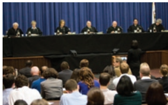
The Supreme Court in session at Berkeley Law’s Boalt Hall.