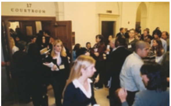
As one group of students exits the courtroom, the next prepares to enter.