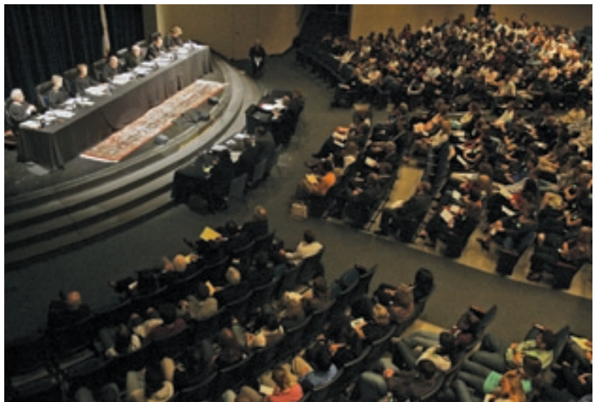
Students fill the auditorium at Sonoma Country Day School, Santa Rosa.