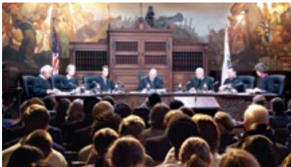
The justices prepare to hear the first oral argument.