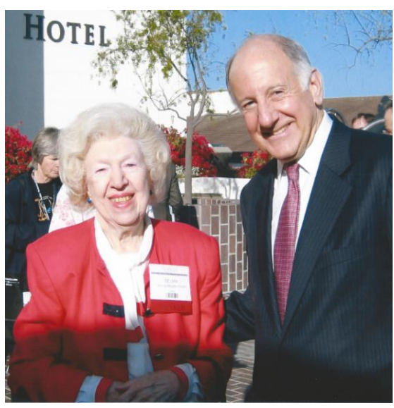
Chief Justice Ronald George with SMS — California State Bar Conference, Monterey, Oct. 7, 2006.

Zakheim: It's true. They didn't have much publicity. They had no footprint in the public —