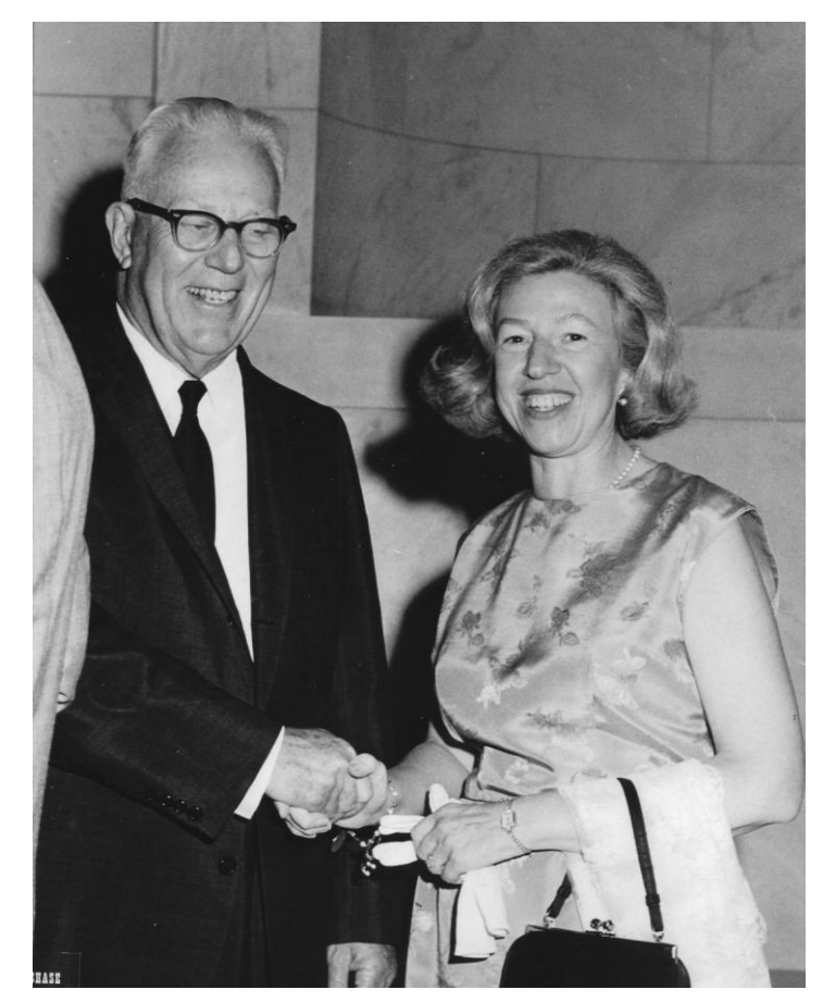
Chief Justice Earl Warren with SMS at the U.S. Supreme Court, First Washington World Conference on World Peace Through Law, September 12-18, 1965.

Zakheim: [reading the caption:] "World Peace