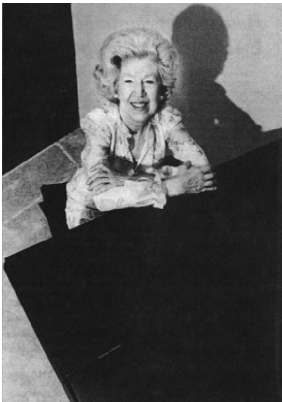
On the premiere of her orchestral suite, “Espressivo” — feature story and photo (at her piano), Los Angeles Times, October 1986.

PHOTO BY CASSY COHEN. COPYRIGHT © 1986 LOS ANGELES TIMES. REPRINTED WITH PERMISSION.