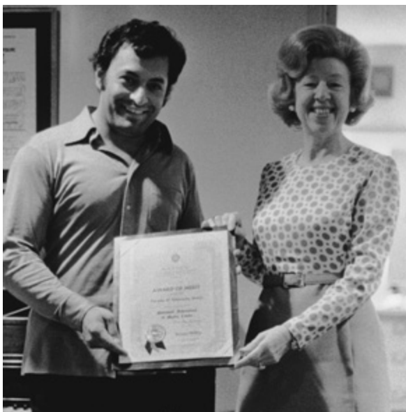
Presenting an award to Los Angeles Philharmonic Conductor Zubin Mehta in his office at the Los Angeles Music Center, November 1975.