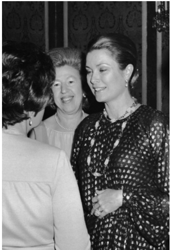
Celebrating the 20th Anniversary of the National Board of the Medical College of Pennsylvania — in the receiving line with (fellow board member) Princess Grace of Monaco, Sheraton-Carlton Hotel, Washington, D.C., December 1973.