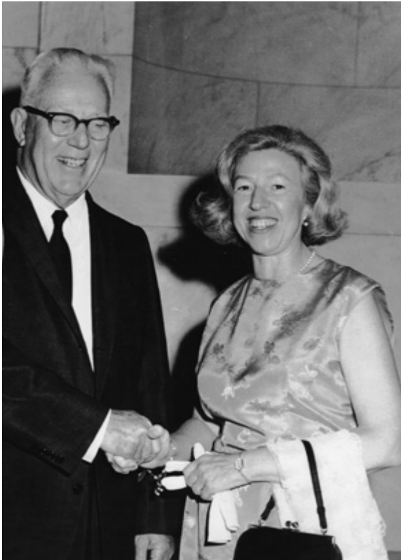
At the U.S. Supreme Court — with Chief Justice Earl Warren during the Washington World Conference on World Peace through Law, September 1965.